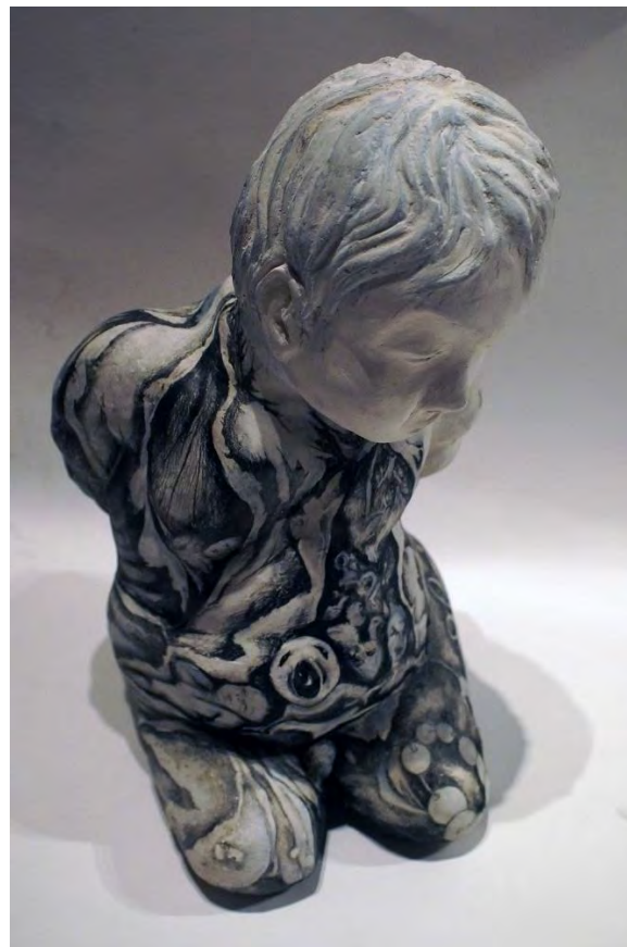
Fig.22 Lissie Brown, Inexplicable , unfinished, 2022.