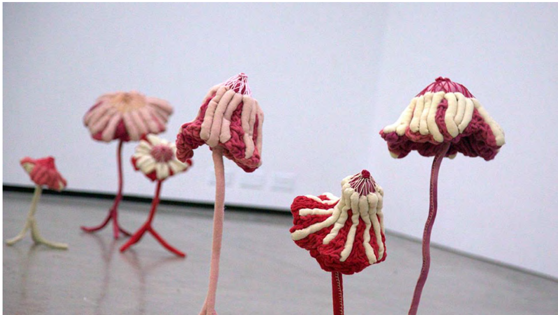
Figure 8. Lissie Brown, Fruit, detail , 2023, installation. Mixed media.