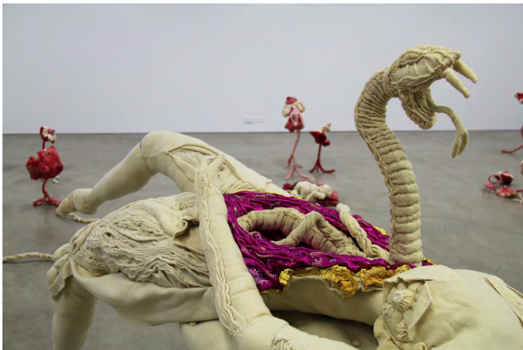
Figure 2. Lissie Brown, Fruit, detail of serpent , 2023, installation. Mixed media.