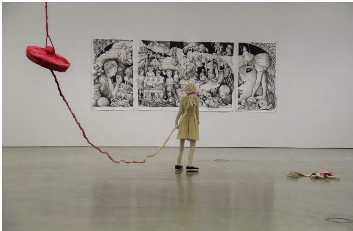
Figure 15. Lissie Brown, Cleanliness Is Next To Godliness and Links in the Chain of Causation , 2023, installation. Mixed media.