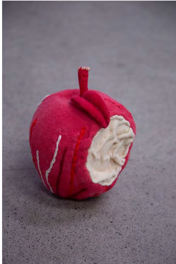
Figure 7. Lissie Brown, Fruit, detail of apple , 2023, installation, Photo copyright Lissie Brown.