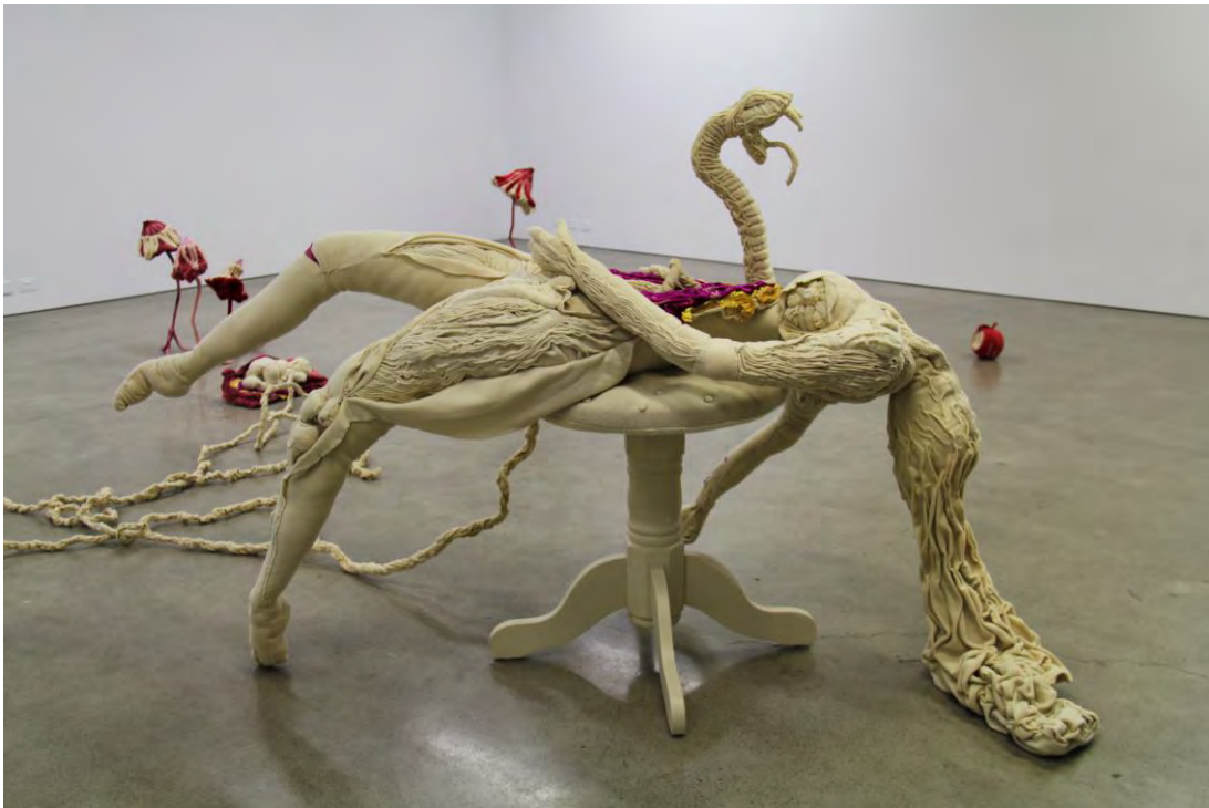
Figure 6. Lissie Brown, Fruit, detail of Eve , 2023, installation. Mixed media.