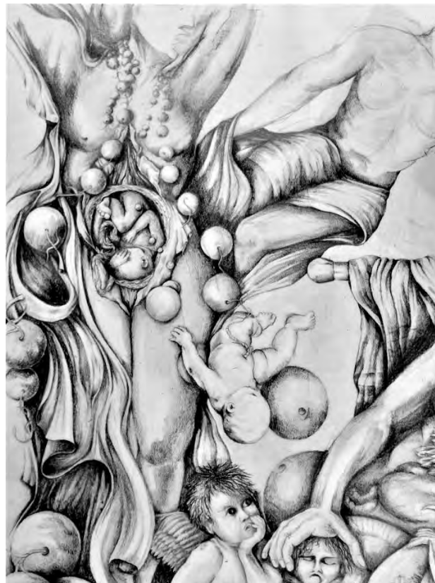
Fig.73 Lissie Brown, Blanket Stitch , detail, 2021.

Motherhood is the thread of humanity that links generations and shapes futures. It is also simply a gender specific term for parenthood. A mother, is a parent, is a human; surely that alone is grounds for the deconstruction of gender roles and equal rights for all.