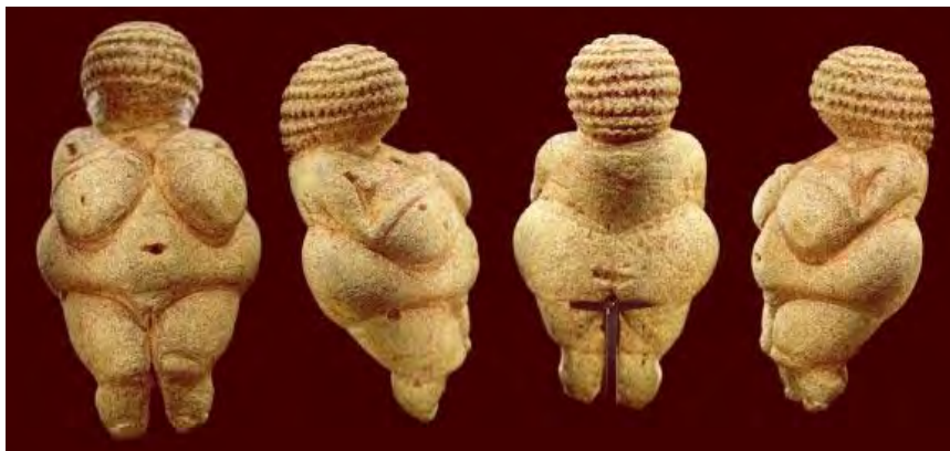
Fig.53 The Venus of Willendorf , c. 30,000 BCE.

https://www.harpersbazaar.com/celebrity/latest/a10028784/beyonce-pregnancy-timeline/