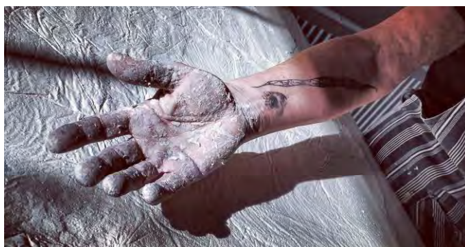
Fig.70 Myself , 2022.

So who am I? I am myself. I am also the sum of many. A blend of lives passed down through generations, I hold the fragments of others in the palm of my hand. Each breath I take, is the continuation of the breath of my ancestors. They are alive in me. I am their daughter, and I stand now at the front of the line. It is my turn to lead. I have found my own voice and taken my rightful place in the world, that had nothing to do with my gender.