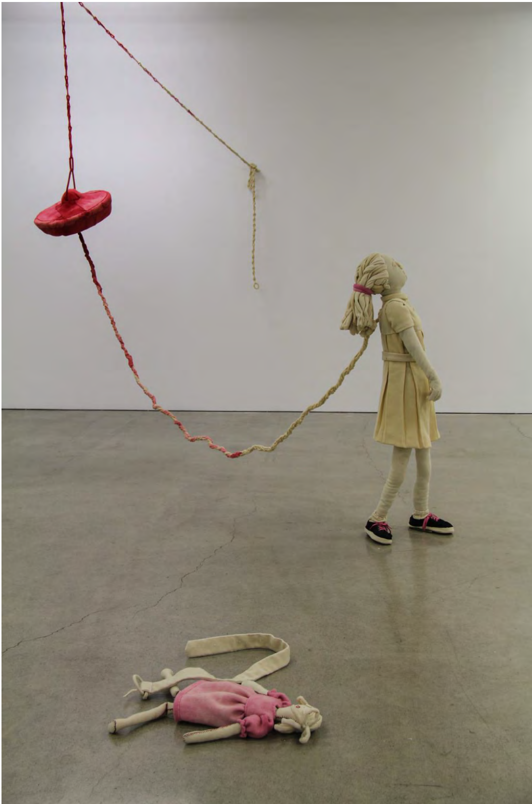
Figure 14. Lissie Brown, Cleanliness Is Next To Godliness , 2023, installation. Mixed media.