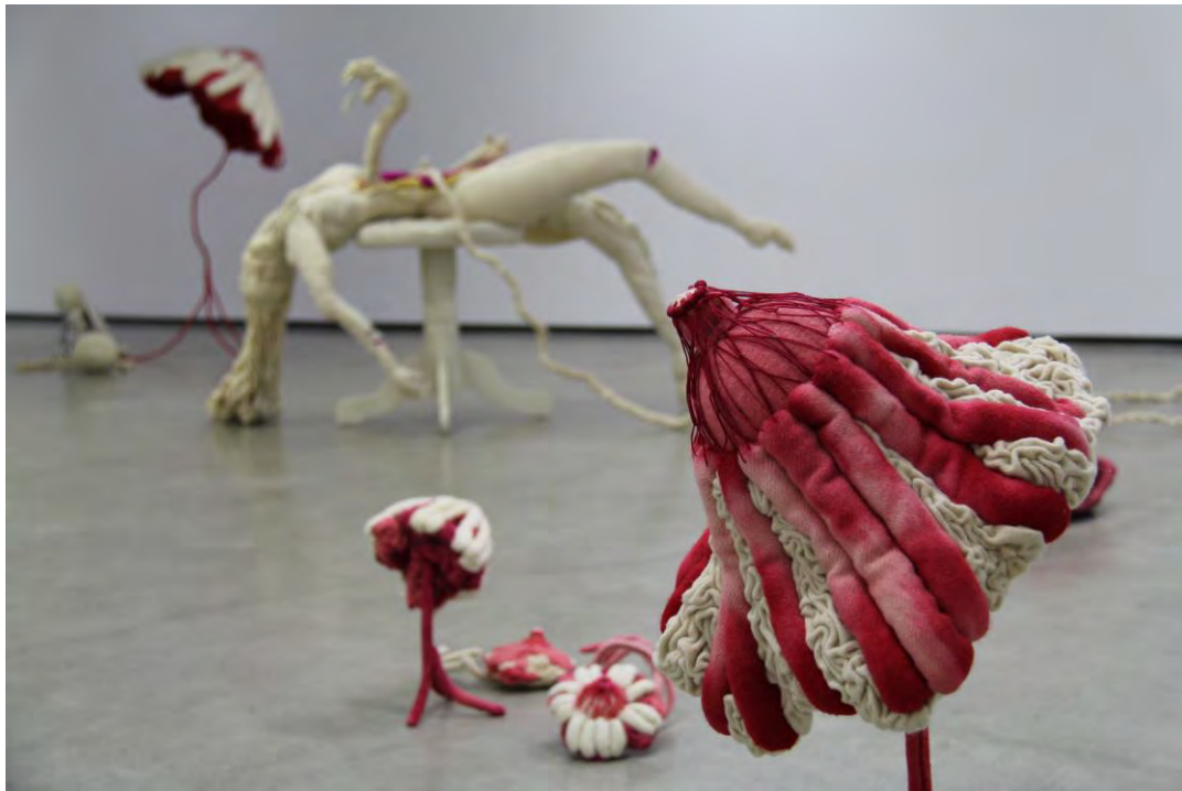
Figure 1. Lissie Brown, Fruit, detail , 2023, installation. Mixed media.