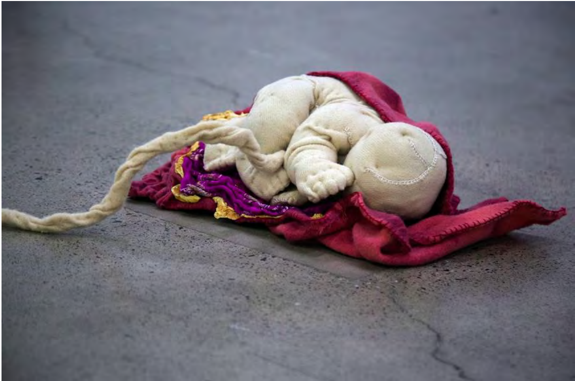
Figure 9. Lissie Brown, Fruit, detail of foetus , 2023, installation. Mixed media