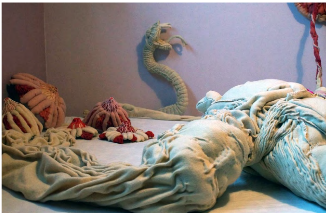
Fig.1 Lissie Brown, Fruit , detail of work in progress, 2022.