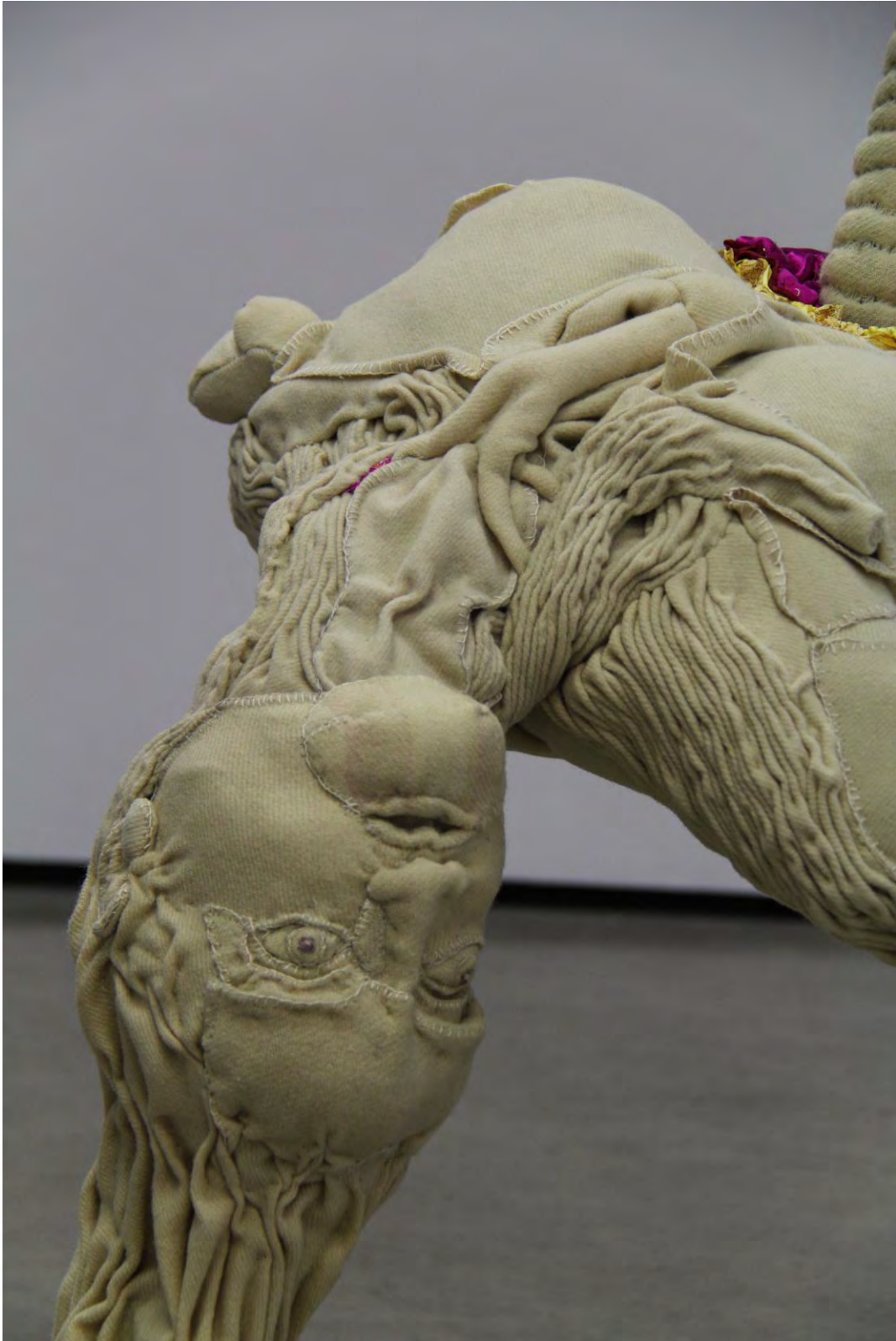
Figure 3. Lissie Brown, Fruit, detail of Eve , 2023, installation. Mixed media.