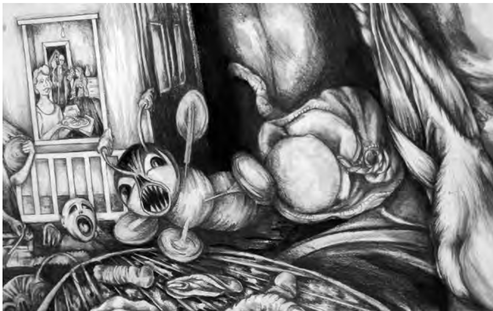
Fig. 50 Lissie Brown, Links in the Chain of Causation , 2022

This feedback encouraged me to explore the power of the nostalgia of things in my work and the use of objects linked to memory has been used in Links in the Chain of Causation , and Fruit (Figs.50 and 51).