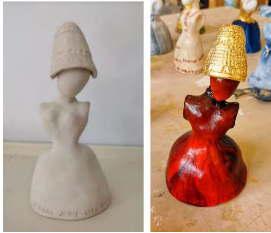
Figs.13 and 14 Lissie Brown, Figurine of Jeanne a Benejueq , 2020.