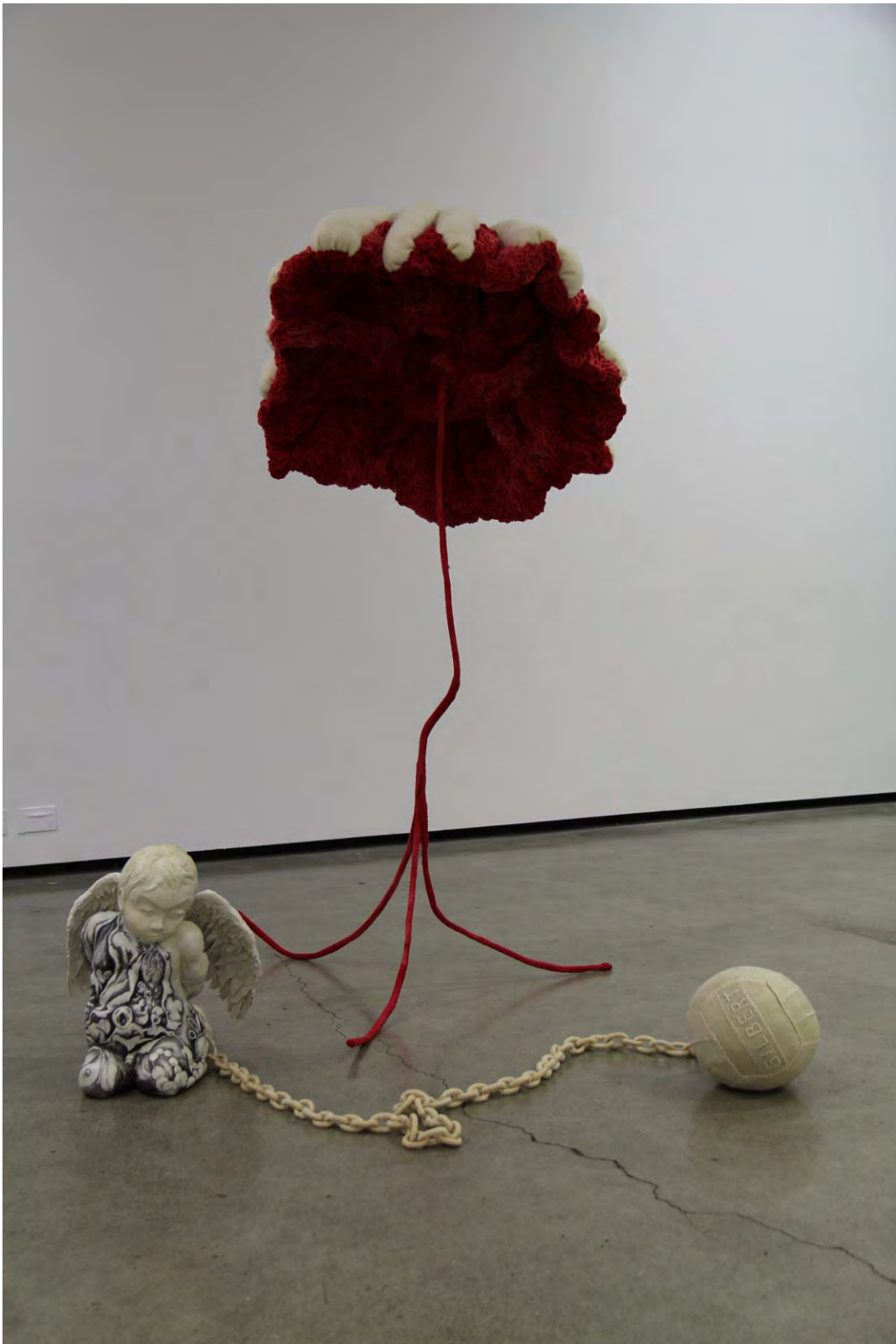
Figure 11. Lissie Brown, Inexplicable , 2023, installation. Mixed media.