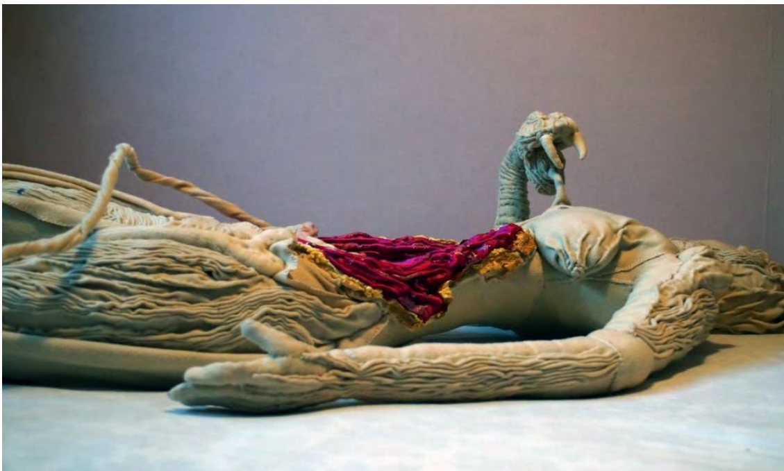
Fig.33 Lissie Brown, Fruit , detail of work in progress, 2022.

Fruit (Fig.33) represents a woman who is laid bare, her skin is pulled back revealing organs, muscle, and bone, a casing for the inner workings of the human body. The abdomen, an open wound, contains no womb, instead a serpent rises up, turning into umbilical cord attached to objects that relate to women both physically and psychologically.