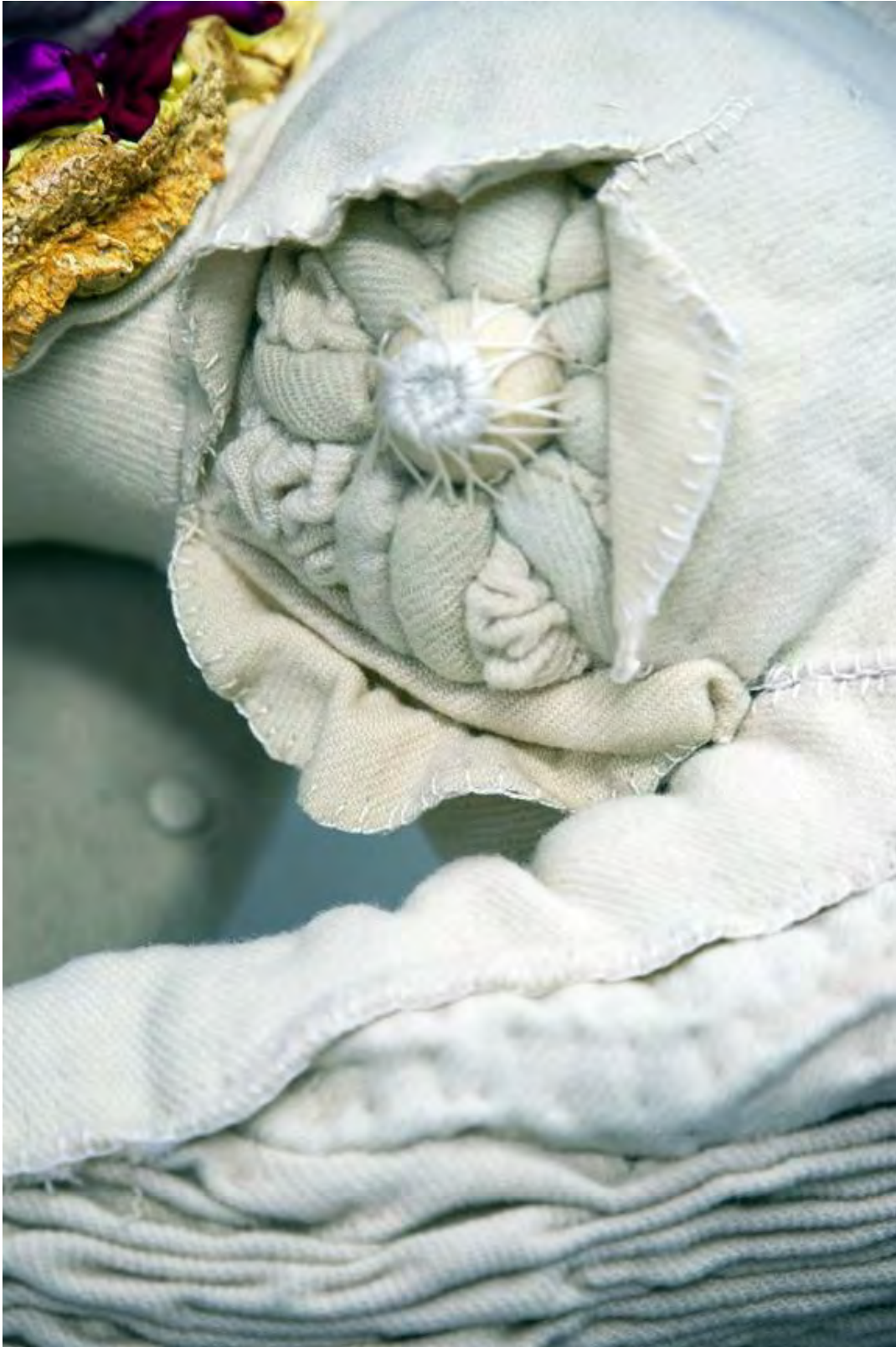
Figure 4. Lissie Brown, Fruit, detail of Eve , 2023, installation. Mixed media.