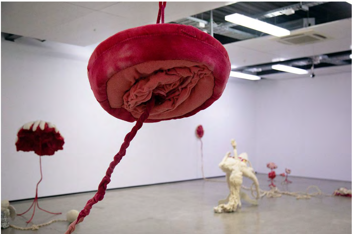
Figure 13. Lissie Brown, Death of a Woman , 2023, exhibition installation. Mixed media.