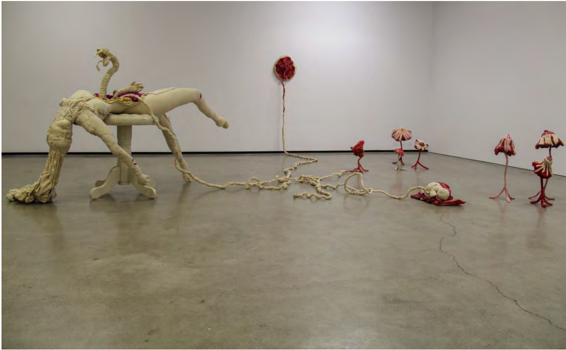
Figure 5. Lissie Brown, Fruit, detail , 2023, installation. Mixed media.