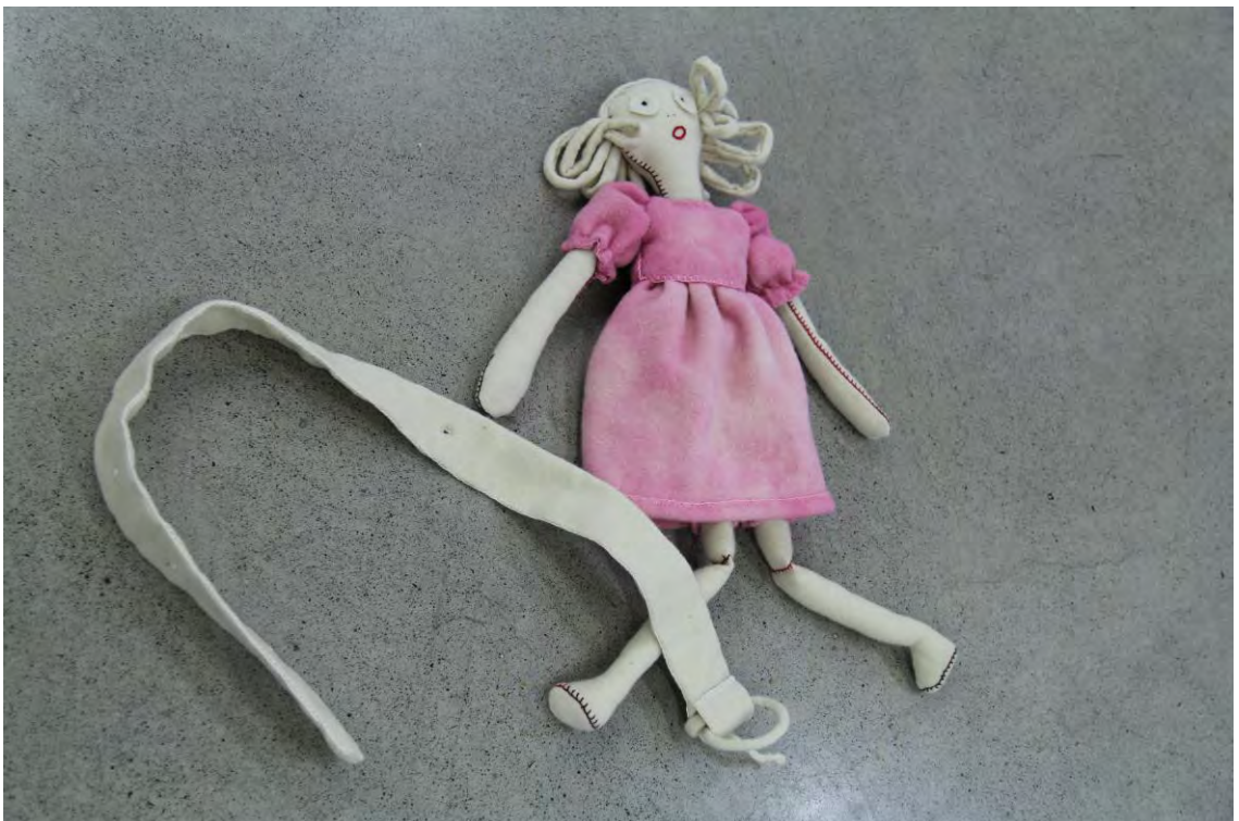
Figure 10. Lissie Brown, Cleanliness Is Next To Godliness, detail , 2023, installation. Mixed media.