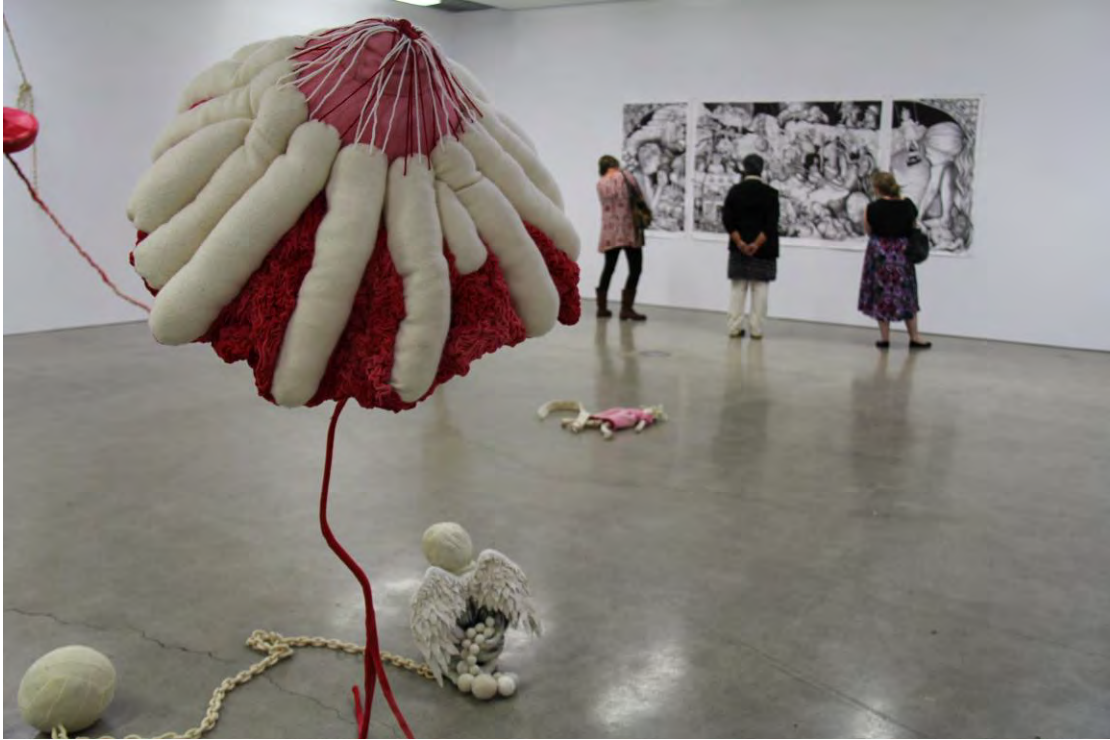
Figure 12. Lissie Brown, Death of a Woman , 2023, exhibition installation. Mixed media.