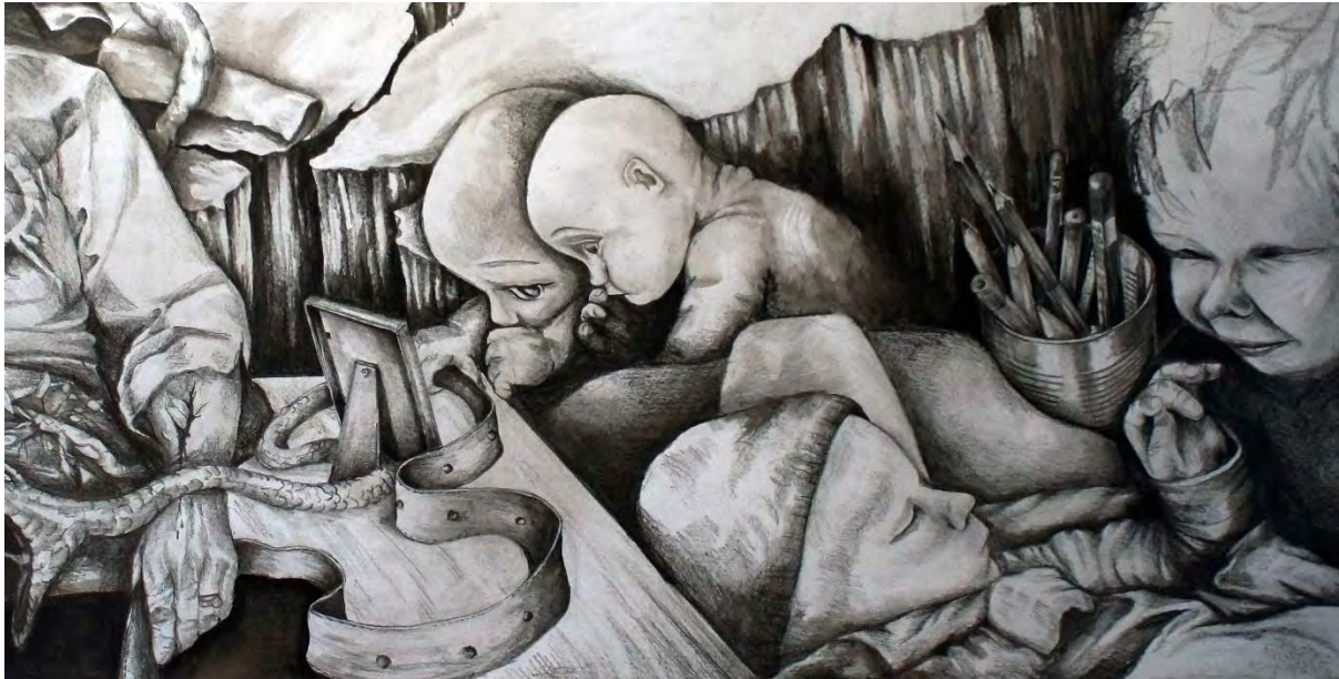
Fig. 44 Lissie Brown, Links in the Chain of Causation , detail, 2022.

Representing the emotional attachment of one human to another, objects hint at ghosts of past generations and their influence on the present. From suggestions received I selected objects that I felt were universally relatable to motherhood. Due to the threatening and disturbing memory of the belt I choose not to include this in the finished work. It can however be seen in Links in the Chain of Causation (Fig.44) placed on a table next to an image of my mother.