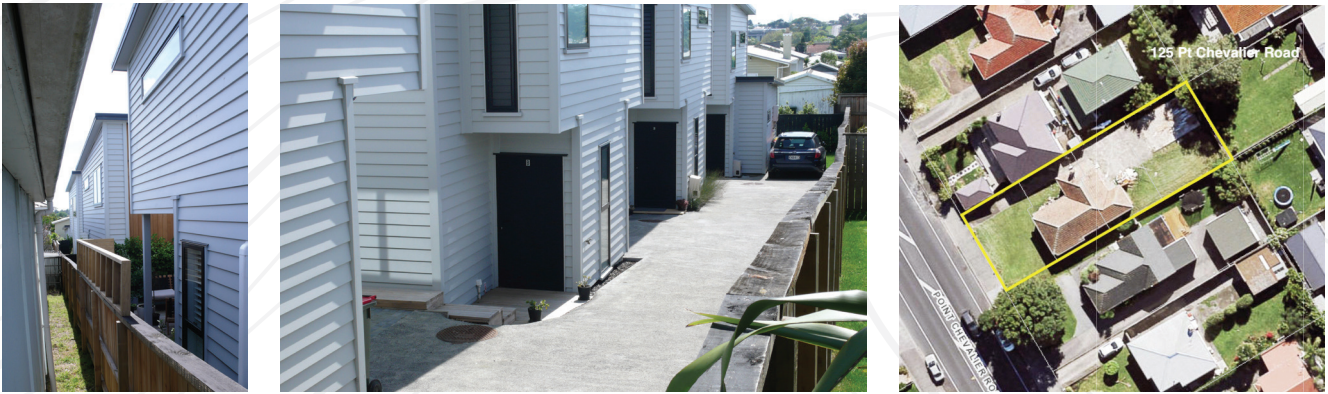
Figure 2. 125 Point Chevalier Road: north boundary, south access drive and site plan diagram. Photographs: Tektus A&R. Map: Google Earth