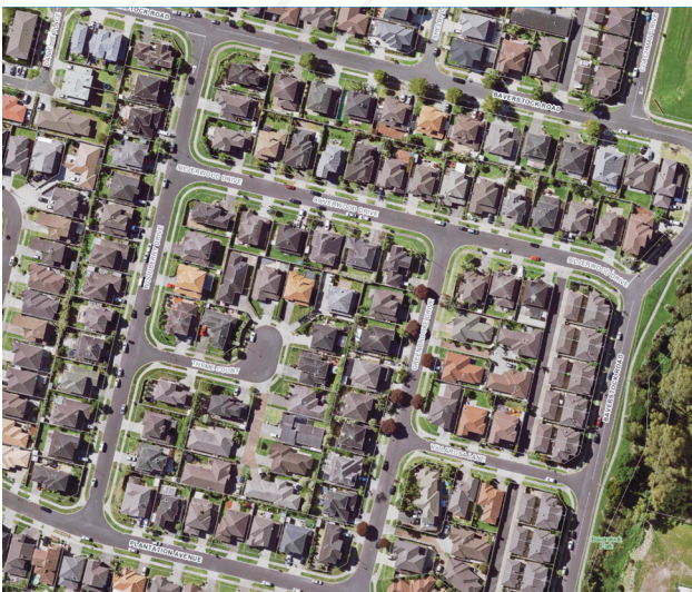
Figure 3. Flat Bush: a typical block on Greenbrooke–Woodberry Drive.

in the sense that individual, rather than shared, values are explicit. It aligns with a suburban-oriented market preference for separate buildings, which appears to stem from embedded preconceptions – that separate buildings continue the habit of individuation through separate land titles, and that the owner can make independent decisions about maintenance, or even in the longer term, demolition and replacement.