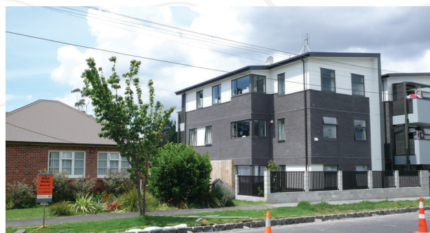
Figure 1. 15–23 Rawalpindi Street, Mt Albert.

Alongside advances in their building technologies, housing providers have evolved their operational systems with the AUP: rather than scores of builders producing a handful of units per year, some developers now have the capacity to supply hundreds of units, with many variations. The apartment typology is most suited to either corner sites or sites with long street frontages, using a dual aspect cross-ventilated plan with vertical circulation between paired apartments at each floor level. This model is appearing extensively in the public housing sector. Where the typology has been designed on a deep, narrow-fronted site (with, for instance, a standard 15–18m suburban street-edge dimension) the preferred dual-aspect plan is less able to maximise the value of its basic characteristics.