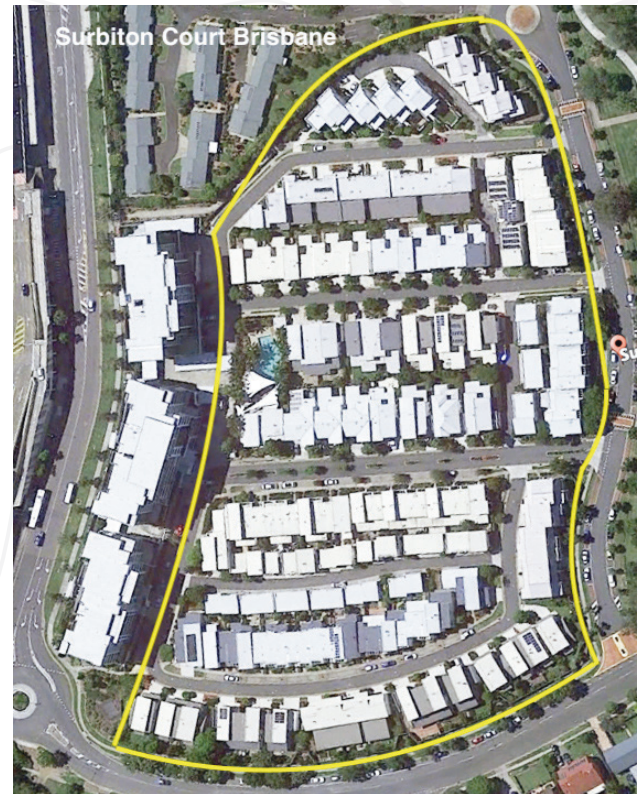
Figure 5. Surbiton Court, Brisbane, 2016.

Problems associated with these higher-density detached layouts have been anticipated in studies in Australian planning for some time. The extreme reduction of private external space that results from loss of set-back rules, coupled with the developer's readiness to increase floor areas for sales purposes rather than any apparent domestic practicality, has been criticised in Australian literature for some time, particularly in Victoria. 8 A gradual tightening of design guides appears to be the main response by the authorities. Public interest in developments built for the investment market in Australia also has a smaller influence on supply than in it does in New Zealand, where, for politically ideological reasons, the tax system