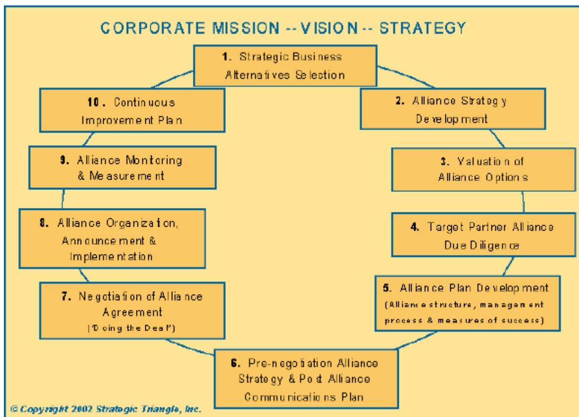
Figure 5 Ten steps in a process of successful alliance construction (Biggs,2006)

it would perhaps be reasonable to conclude that the majority of alliances by New Zealand questors would be tactical in nature, and a lack of a long term company vision or strategy would therefore not impact on the success of such an alliance, at least in the short term.