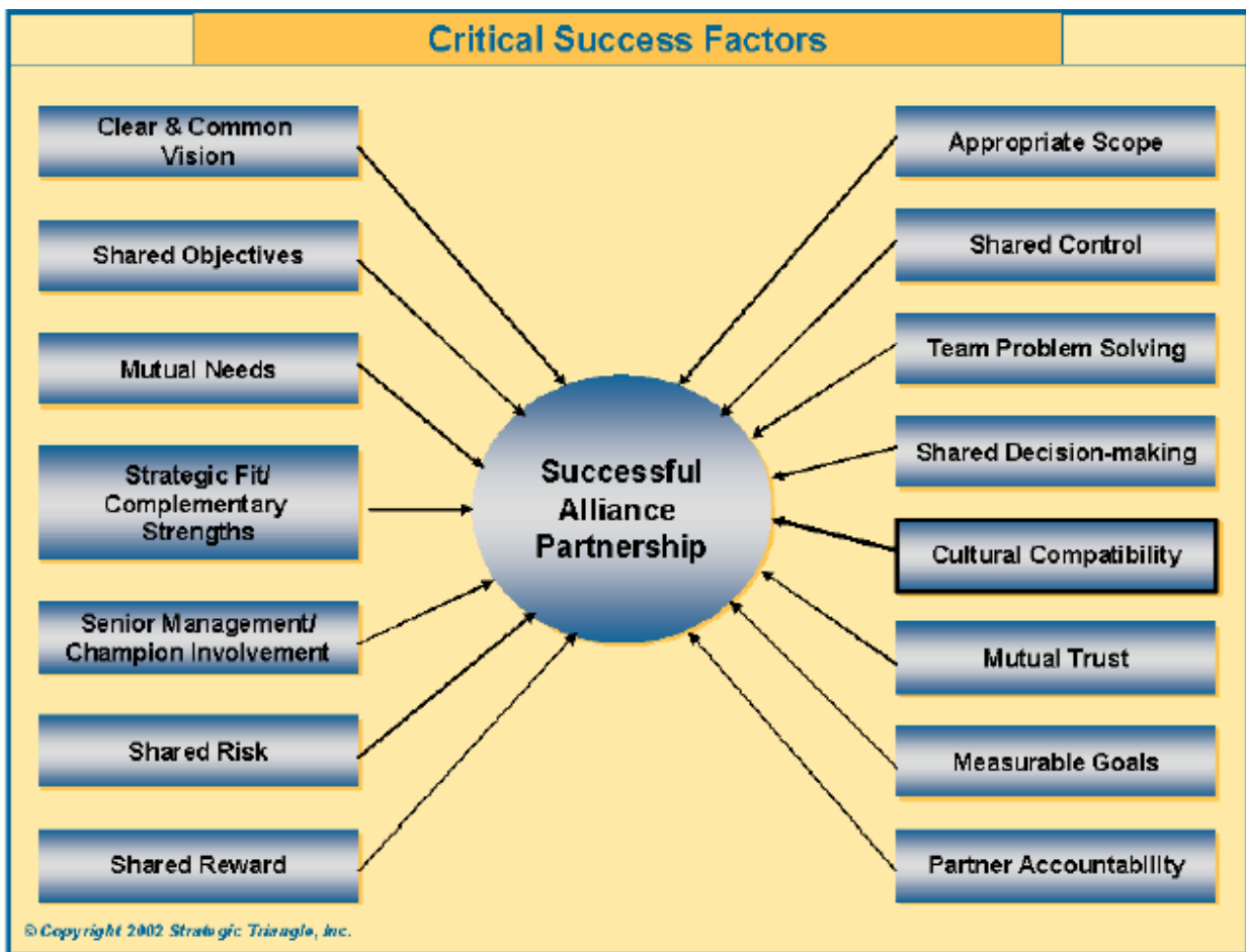
Figure 1 Critical Success Factors affecting Strategic Alliances (Biggs,2006)

skills, resources and contributions that each bring to the alliance, the alliance is doomed. Many alliances fail and break apart, and never reach their intended potential, because of frictions and conflicts among the partners. Ongoing commitment, mutual learning and continued close collaboration will go a long way to developing a strong alliance, with win-win outcomes for both partners, but the reality is that more alliances come apart than stay together. (Pavlovich & Akoorie, 2003). Biggs (2006) identifies the following as key factors that determine the success of a strategic alliance.