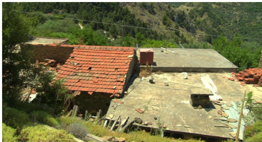
Aikaterina Galanaki's village, Hosti.