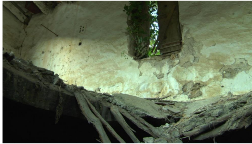
Ruins of the Despotaki house