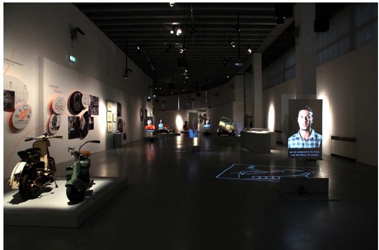
figure 4 The Memorabilia parade along the exhibition path.

These scenarios, which are very different from one another, stress a significant underlying decision not to aim at a single all-embracing future, but on the contrary, to aspire to a multitude of possible, multiple, changing, permeable, combined, high tech and low tech, advanced and traditional futures, in which everybody will be able to freely organize their daily life.