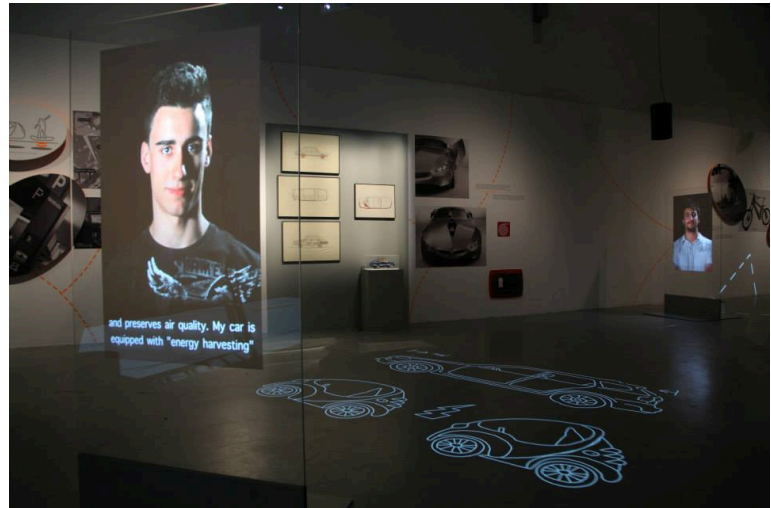
figure 3 One of the twelve interactive totems with the interview to a Milanese of 2033 about the mobility.