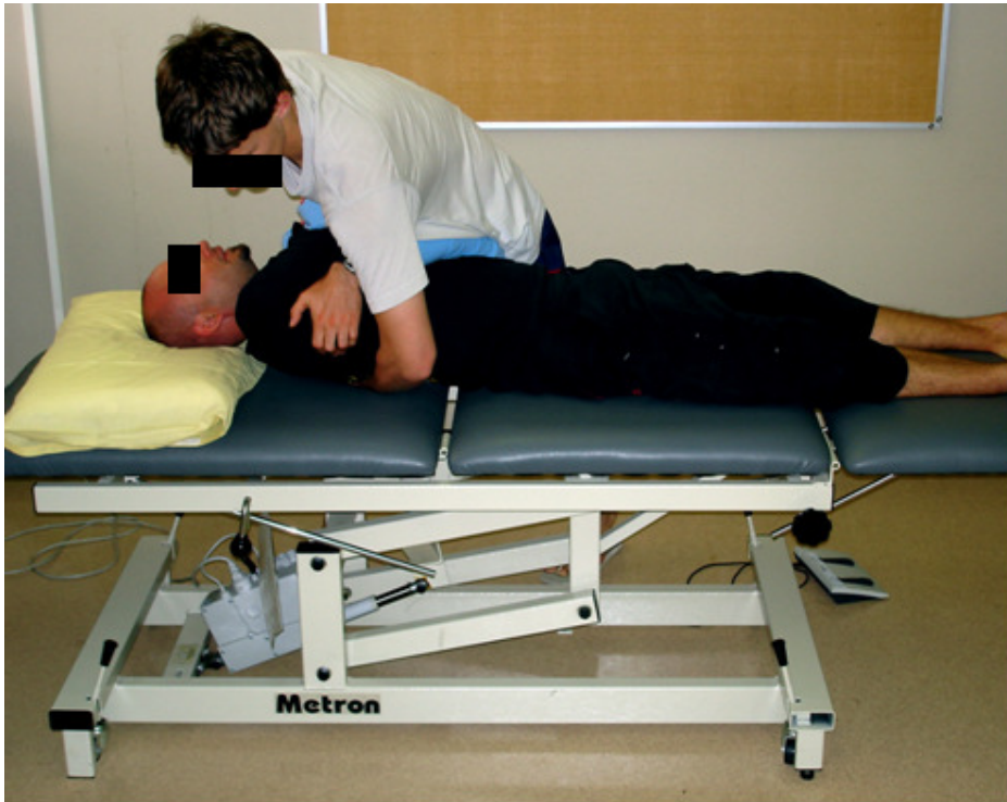
Figure 1 Demonstration of a supine thoracic HVLA thrust technique

The figure illustrates the operator's pre-thrust position of the subject for supine thoracic HVLA thrust technique.