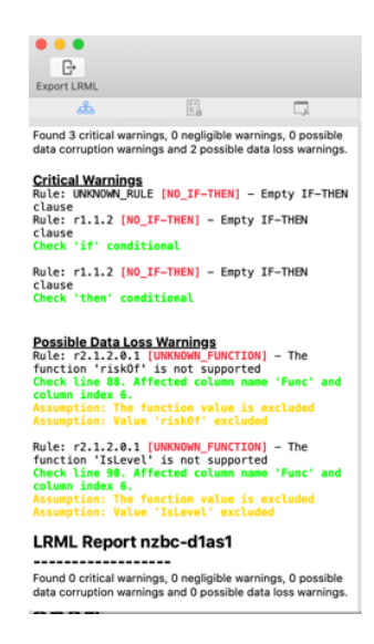
Figure 5: Validation Check Warnings

Once the knowledge capture proforma has passed the peer-review process, it is then subject to validation by the LKM Data Processor, which is a dedicated software application developed independently for managing LKM. The LKM Data Processor also takes prepopulated table schema proformas related to a document and generate the corresponding LRML rules.