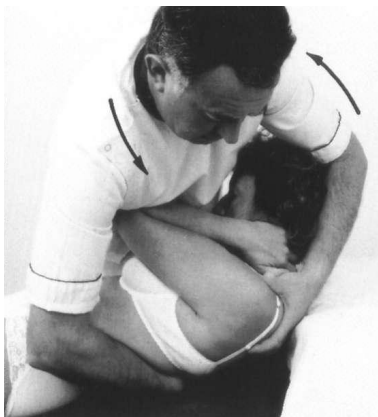
Figure 2. An alternative set-up for a thoracic spine HVLAT technique (Hartman, 1997, p. 124). If this practitioner were female, her breasts would be placed very close to the patient's face. If the practitioner were a smaller build than the patient the practitioner would potentially have difficulty in terms of reach.