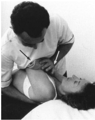
Figure 1. High velocity, low-amplitude thrust (HVLAT) technique set-up position (Hartman, 1997, p. 123). This HVLAT set-up demonstrates potentially uncomfortable compression of the patient's breast tissue.

The catalyst for this project was the experience of being a female osteopathy student, of smaller stature, being taught commonly used practical techniques which sometimes did not seem to be entirely suitable for either female practitioners or female patients. There were issues such as patients' breast tissue being uncomfortably or painfully compressed (Figure 1), or for example, being required as a practitioner to place breasts very close to the patient's face (Figure 2). Some techniques were problematic in terms of requiring a longer reach, or seeming to require a great deal of physical strength if the practitioner was significantly smaller than the patient (Figure 2).