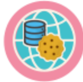
Cookies & Cache