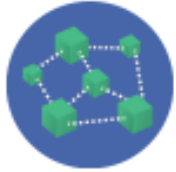
Blockchain & Cryptocurrencies