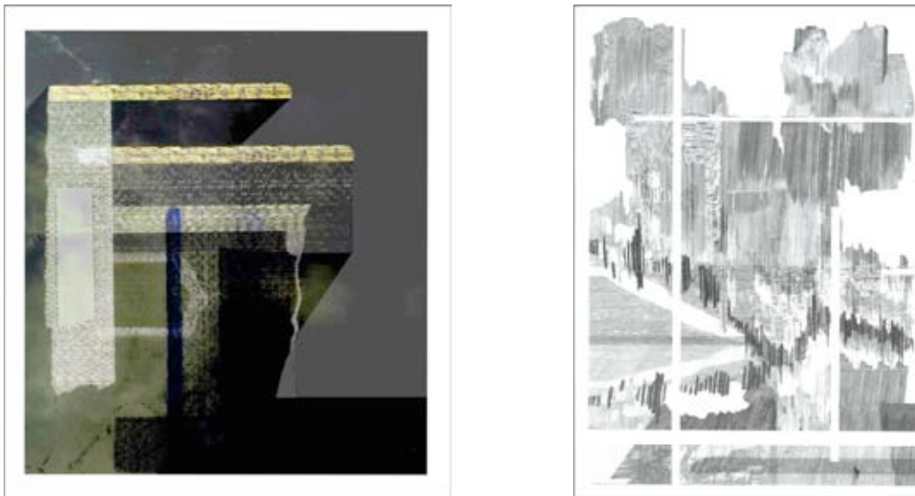
Fig 3. Digital Sectional drawing, Student works, Interior Design, Faculty of Creative Industries + Business Department of Design + Visual Arts, Unitec Institute of Technology

of architectural knowledge. In these graphic fillers can be hidden, intentionally or unintentionally, stimuli too weak to be consciously detected but that can nevertheless powerfully affect our understanding of the architecture in drawing. The repetitive labours and rituals associated with these drawings imply a kind of stillness or an indifference to the time taken in attending to them. [Fig 3.] Frascari writes that the monotony of hatching permits an experience that allows the brain to wander and wonder, an opportunity for daydreaming through the rendering of surfaces. 'The kind of thinking we rely on when we don't really want to think,' a moment of procrastination. 12 He writes that this moment is a crucial moment to achieve creativity, a thought process that allows the brain to make new associations and abstract thought.