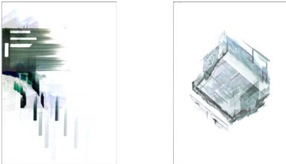
Fig 5. Final Digital Axonometric drawing, Student works, Interior Design, Faculty of Creative Industries + Business Department of Design + Visual Arts, Unitec Institute of Technology

Architectural drawings are representations that are also the results of constructions, the interpretation of conceptual ideas with the process of physical construction of an architectural object. The concrete line complemented by concrete staccato of small individual marks, the line always unfolding always becoming. ‘...mark becoming line, line becoming contour, contour becoming image...the first mark structuring the blank page as an open field but also defines it temporarily as the drawings marks flow on another in time.’ 18