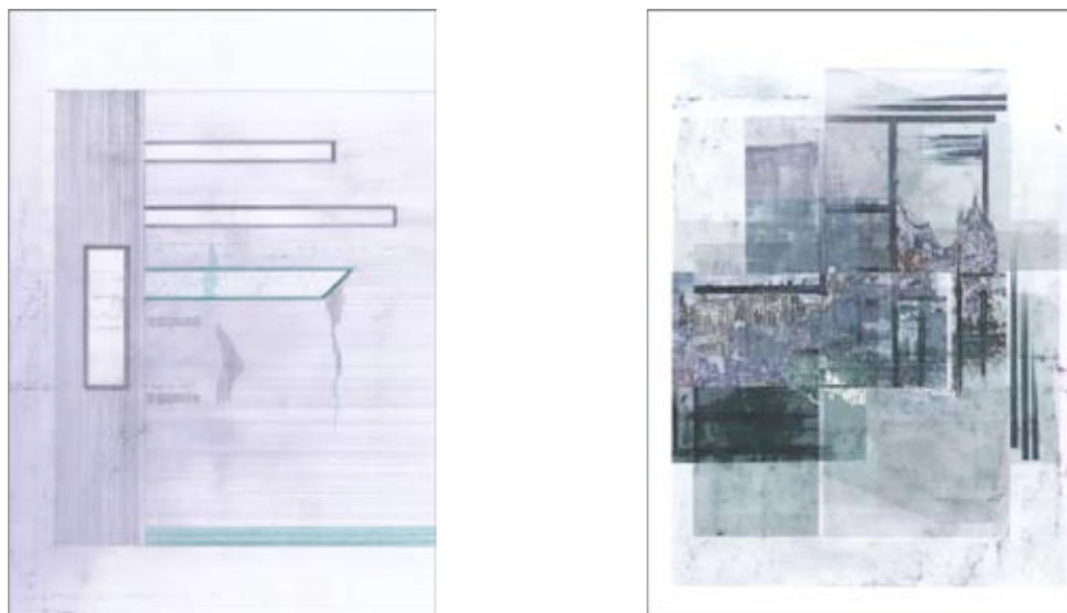
Fig 4. Digital Elevational drawing, Student works, Interior Design, Faculty of Creative Industries + Business Department of Design + Visual Arts, Unitec Institute of Technology

Design can be considered to include both intention and unintention; drawn marks can be treated, as neither arbitrary nor exceptional, as equally accidental marks are not just exceptions to an established order but are to be mastered. For the students these intervals, interferences, alterations or shifts provide a way to identify chance and system in the drawing process. The interval becomes a space, whether it is digital or analogue, opened up by a shift from direct intention to a rule based process. [Fig. 4] The interval is seen as a technique that encourages and assists students to establish and explore accidents and errors in an intensive reflexive engagement with the drawn surface, emergence and other forms of unintention become possible and offer different spatial propositions.