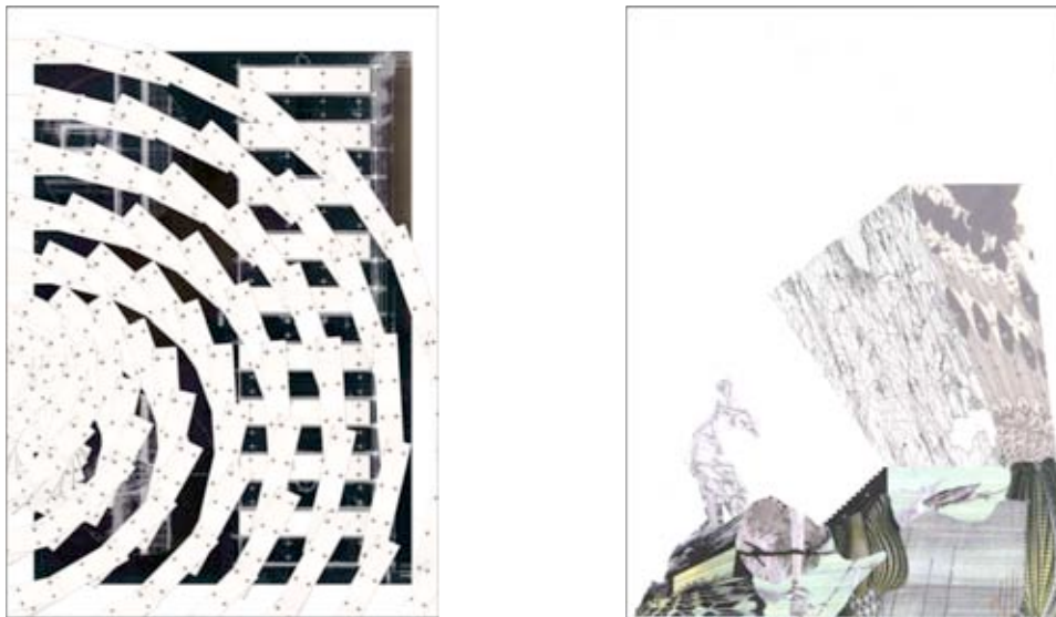
Fig 1. Digital Collage drawing, Student works, Interior Design, Faculty of Creative Industries + Business Department of Design + Visual Arts, Unitec Institute of Technology

properties. Each line or groups of lines offer a multitude of worlds or worlds within worlds. The drawing process begins digitally with collage, several images are provided for the students that they then dissect to reconstruct a new image. This image is then printed and used mechanically to compose an image of 500 lines. [Fig 1.]